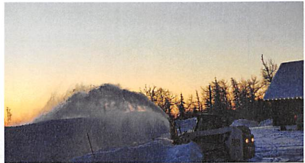
Parks and Trails Tech pushing back snowberms at Government Peak