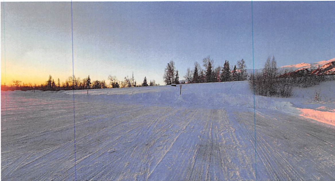
New overflow at GPRA All cleared!

The year 2023 has brought many interesting challenges and seasons for the Parks Department, and with 2024 right around the corner, the crew is ready to take on whatever the new year brings!