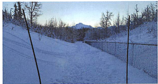
Out Grooming Crevasse Moraine with the Snow cat