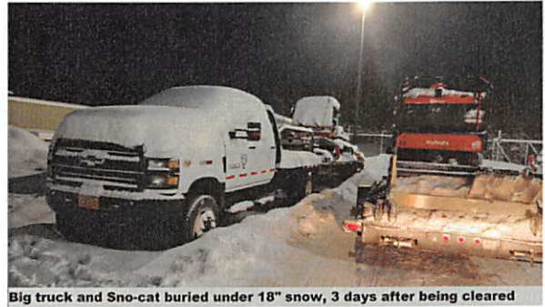
Big truck and Sno-cat buried under 18" snow, 3 days after being cleared

The snow continues to fall, and hours of plowing are in the future of both seasonal new hires for the Parks Department. One of which will be working weekends to keep up with the high demands at the trailheads for the hikers, skiers, sledders, and dog walkers that use them daily.