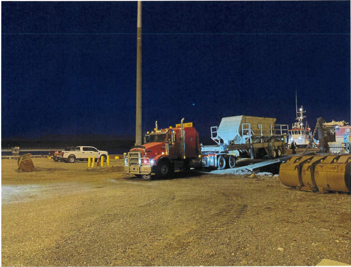
Mining equipment driven off the barge from Platinum