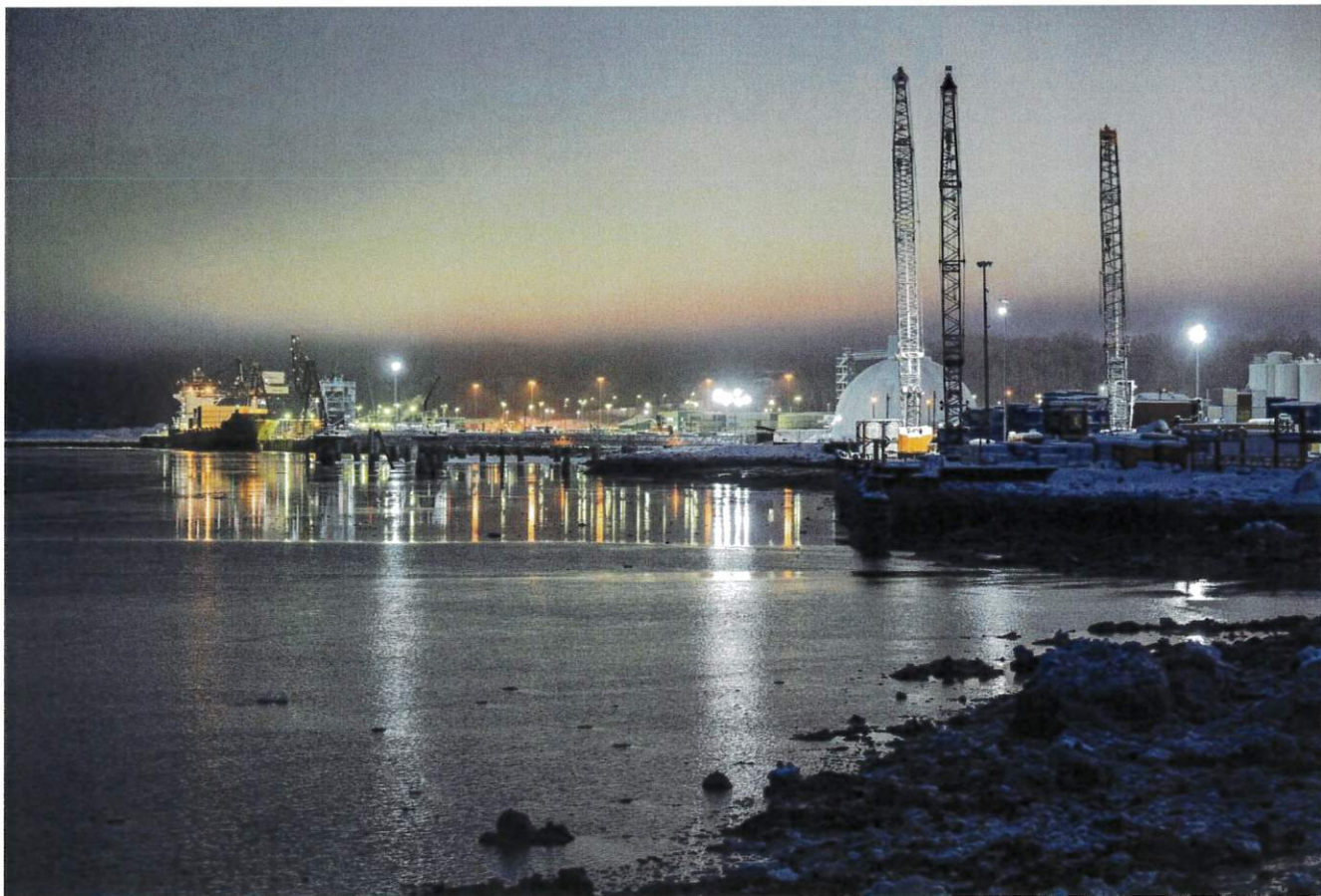
Port of Alaska lights reflect in Cook Inlet in Anchorage.

The Anchorage Assembly has renamed the Port of Alaska after late U.S. Rep. Don Young. Members on Tuesday voted on a new name — the Don Young Port of Alaska — after a monthslong back-and-forth.