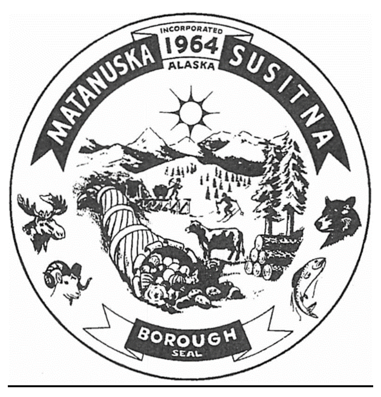
SECTION IV CONTRACT AGREEMENT (38 Pages)