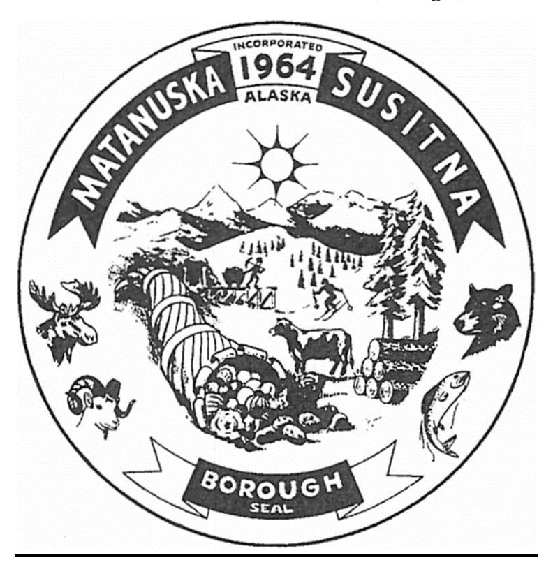
SECTION IV CONTRACT AGREEMENT (38 Pages)