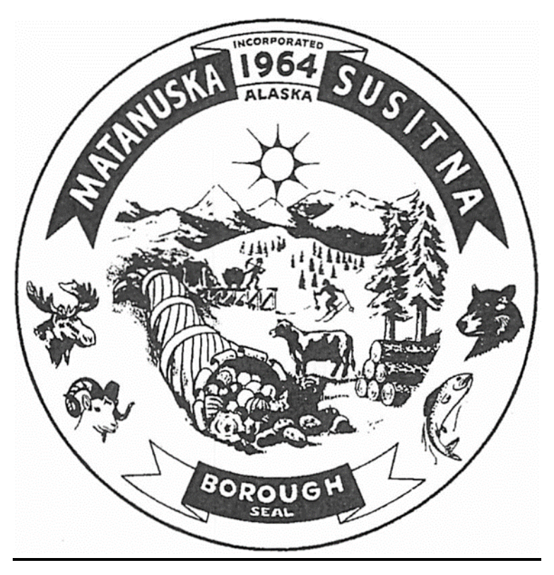
SECTION IV CONTRACT AGREEMENT (38 Pages)