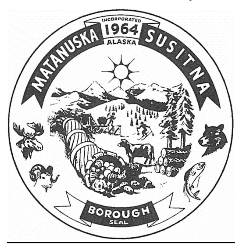
SECTION IV CONTRACT AGREEMENT (38 Pages)