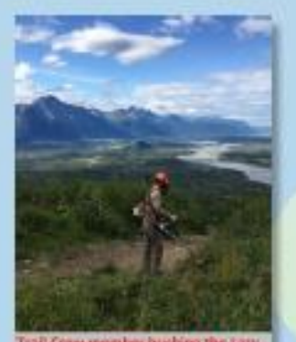
Trail Crew member bushing the Lasy Moose Trail on Last Mountain

By purchasing a yearly permit or your daily parking fee, you help keep trails and facilities clean and maintained. Please be aware that the State parking permit does not cover the same trails as the Borough parking permit and you may be fined if you do not have the correct permit.