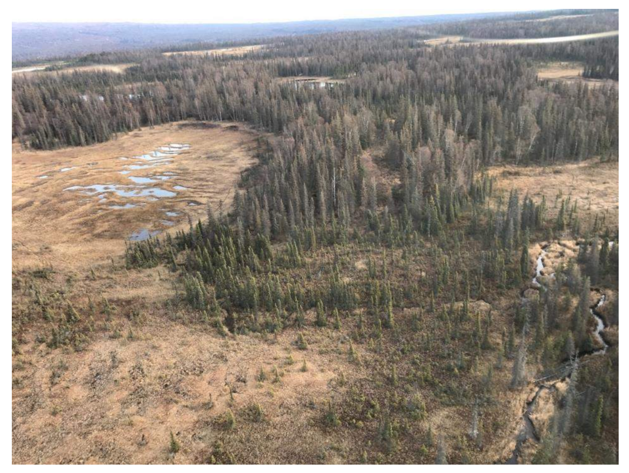
Figure 16: Typical intermixed wetland and forested wetland from Pretty Creek to Talachulitna Creek