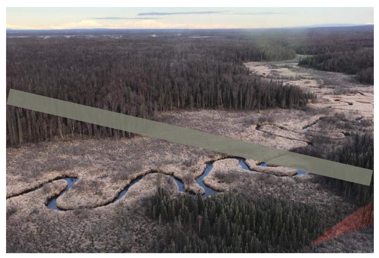
Figure 2: Fish Creek looking upstream and showing the approximate crossing location (looking north)