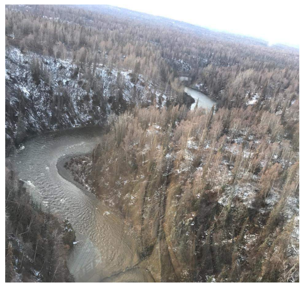
Figure 7: Talachulitna River (looking upstream [south]) at the approximate crossing location.

• The Talachulitna River crossing location should be further evaluated. As shown in Figure 7 the current alignment crosses at a location where the river flows through a deep narrow canyon, which would require a large single-span bridge. The approaching alignment from the southeast bisects a large pond. A tradeoff study should consider moving the crossing further downstream where the river is in a shallower valley and where the alignment would avoid the ponds.