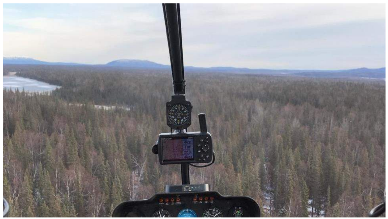
Figure 13: Typical terrain on the on the north side of the Skwentna River