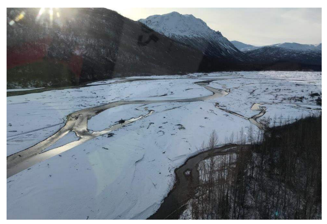
Figure 9: Hayes River crossing location (looking upstream)