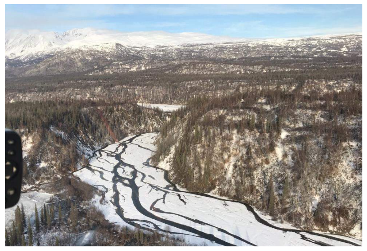
Figure 10: Old Man Creek (looking downstream). Note the steep canyon where the proposed bridge crossing would be located. This bridge would be approximately 1,000 feet long.

• The steep slope from the mountains has caused numerous creeks to carve out deep canyons as seen in Figure 10. At least four of these canyons will need to be crossed with bridges ranging in length from 200 to 1,000 feet.