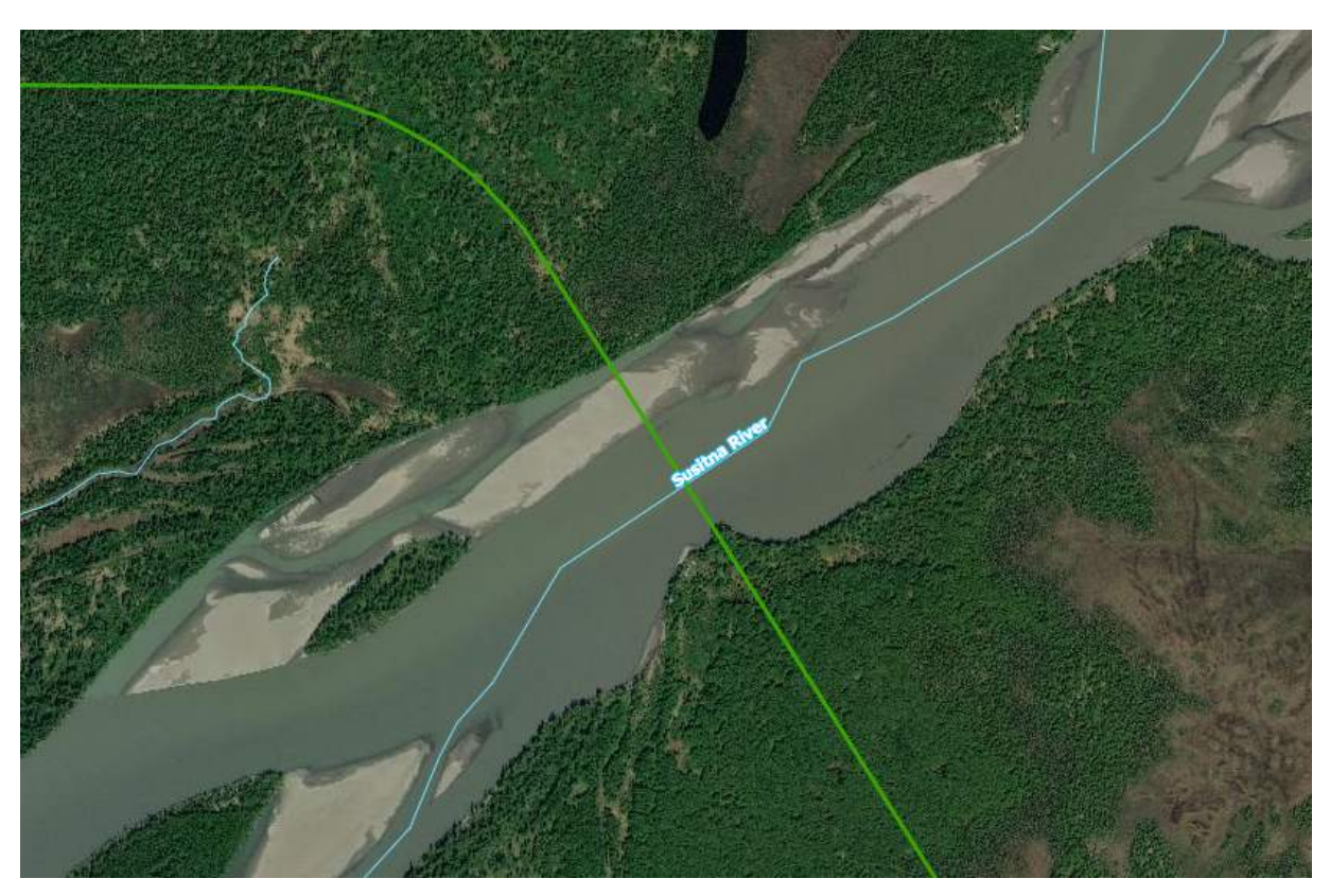
Figure 3: Susitna River crossing