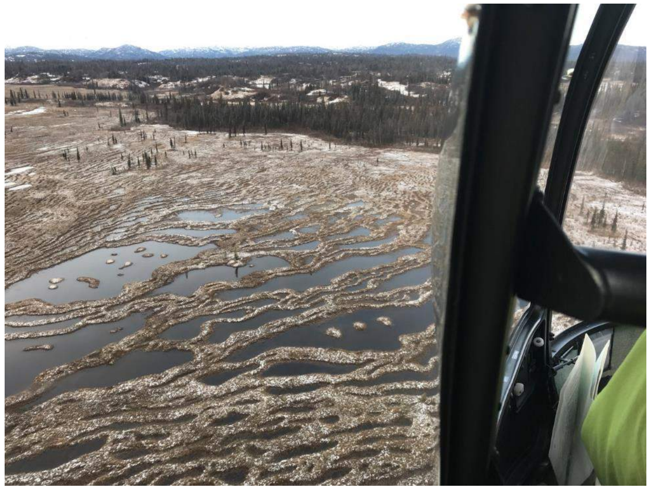
Figure 17: Typical wetland near upper Talachulitna River