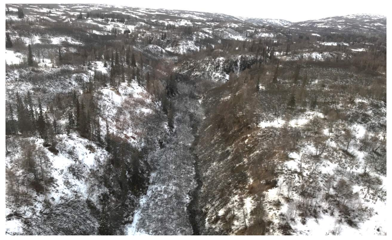
Figure 19: South Route terrain becomes rougher from Friday Creek until tie-in with the PMR