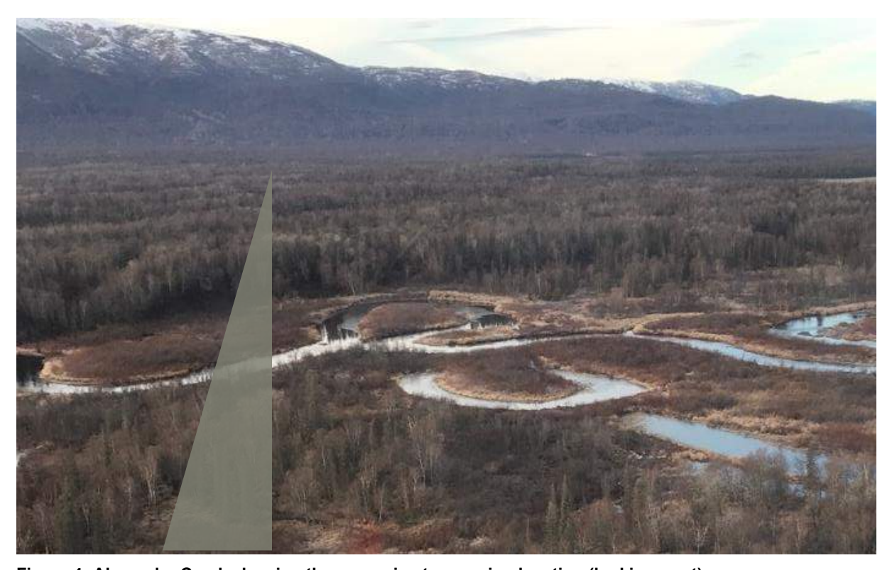
Figure 4: Alexander Creek showing the approximate crossing location (looking west)