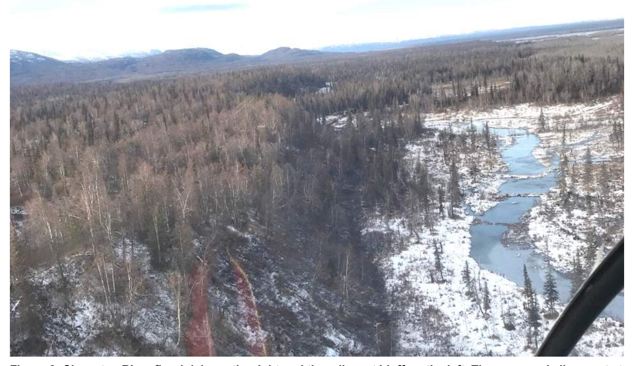
Figure 8: Skwentna River floodplain on the right and the adjacent bluff on the left. The proposed alignment at this location is through the floodplain at the toe of the bluff.