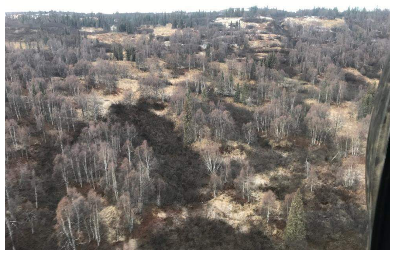
Figure 18: Hilly upland terrain begins near Talachulitna Creek