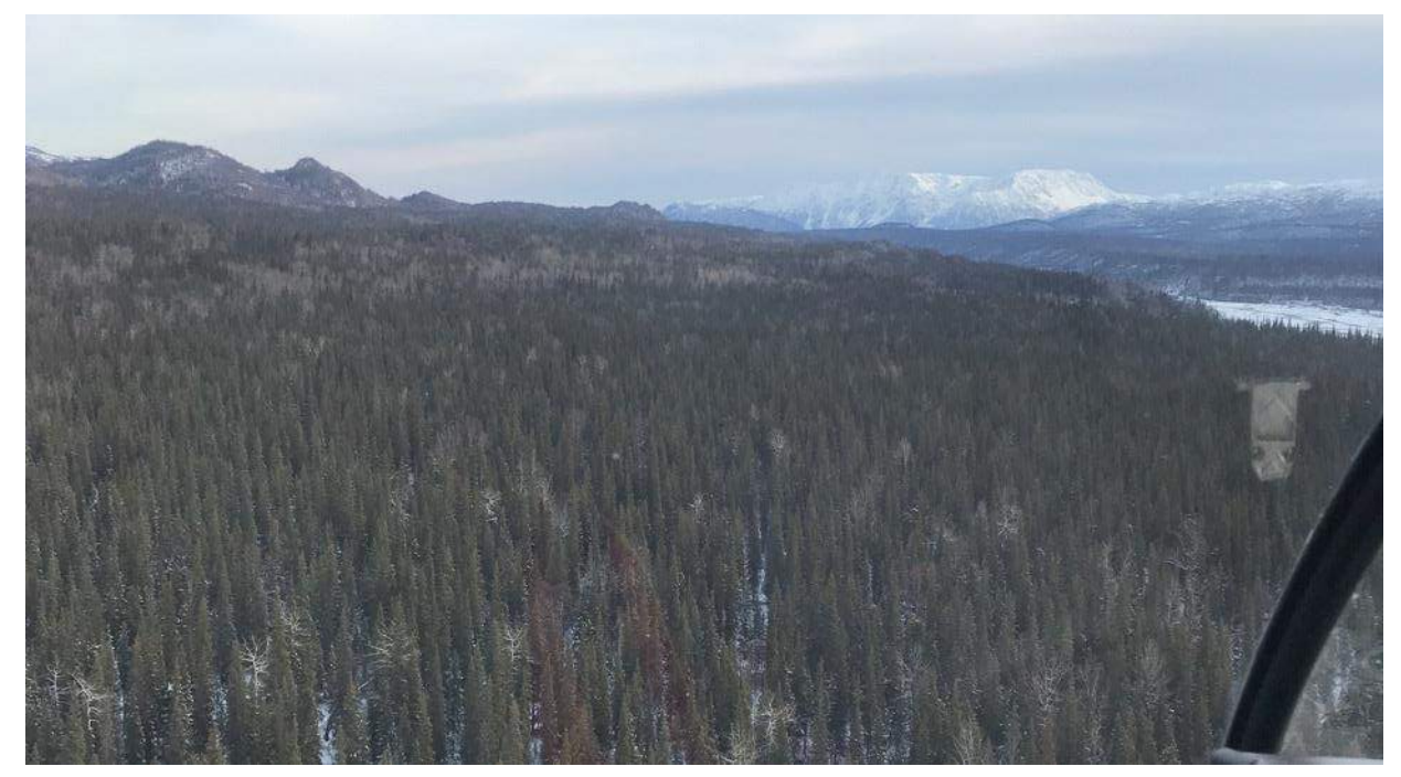
Figure 12: Typical terrain on the on the north side of the Skwentna River