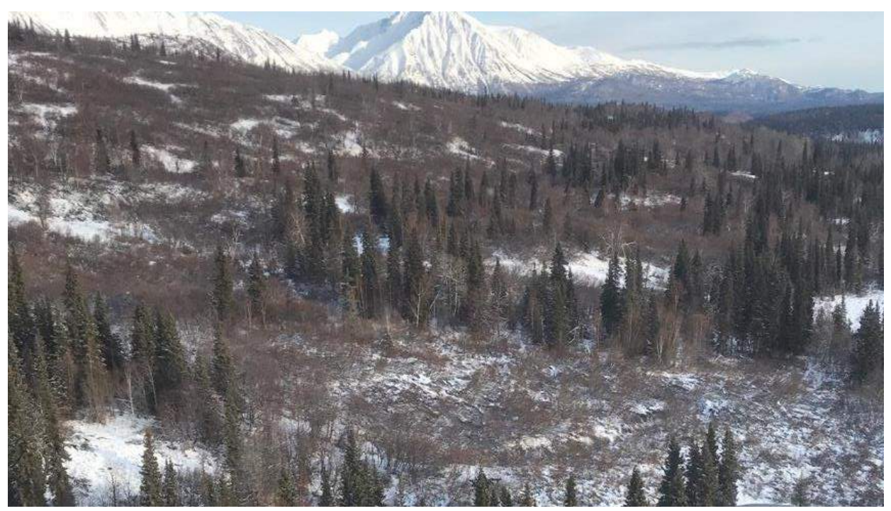
Figure 11: Typical terrain on the on the north side of the Skwentna River