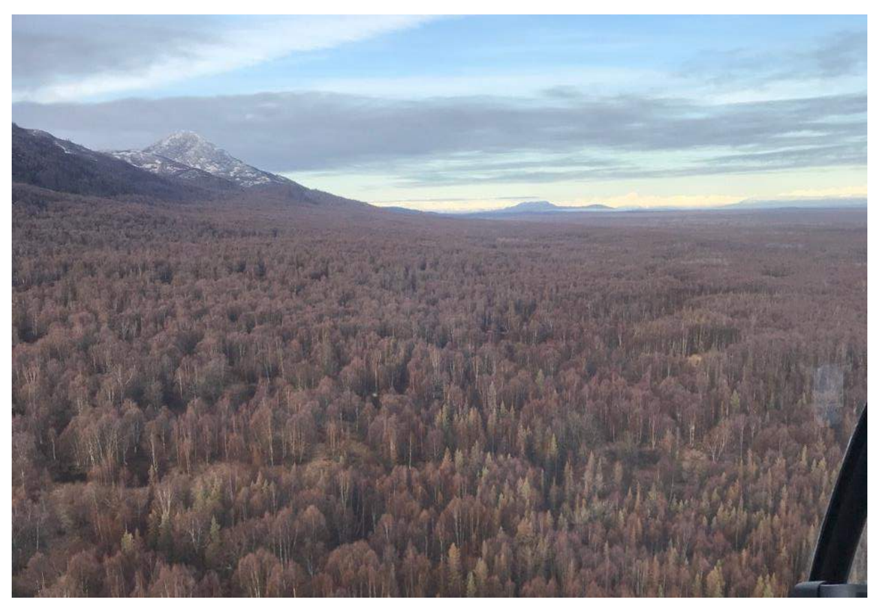
Figure 6: Smooth and gently sloping terrain along the base of Beluga Mountain (looking northwest)