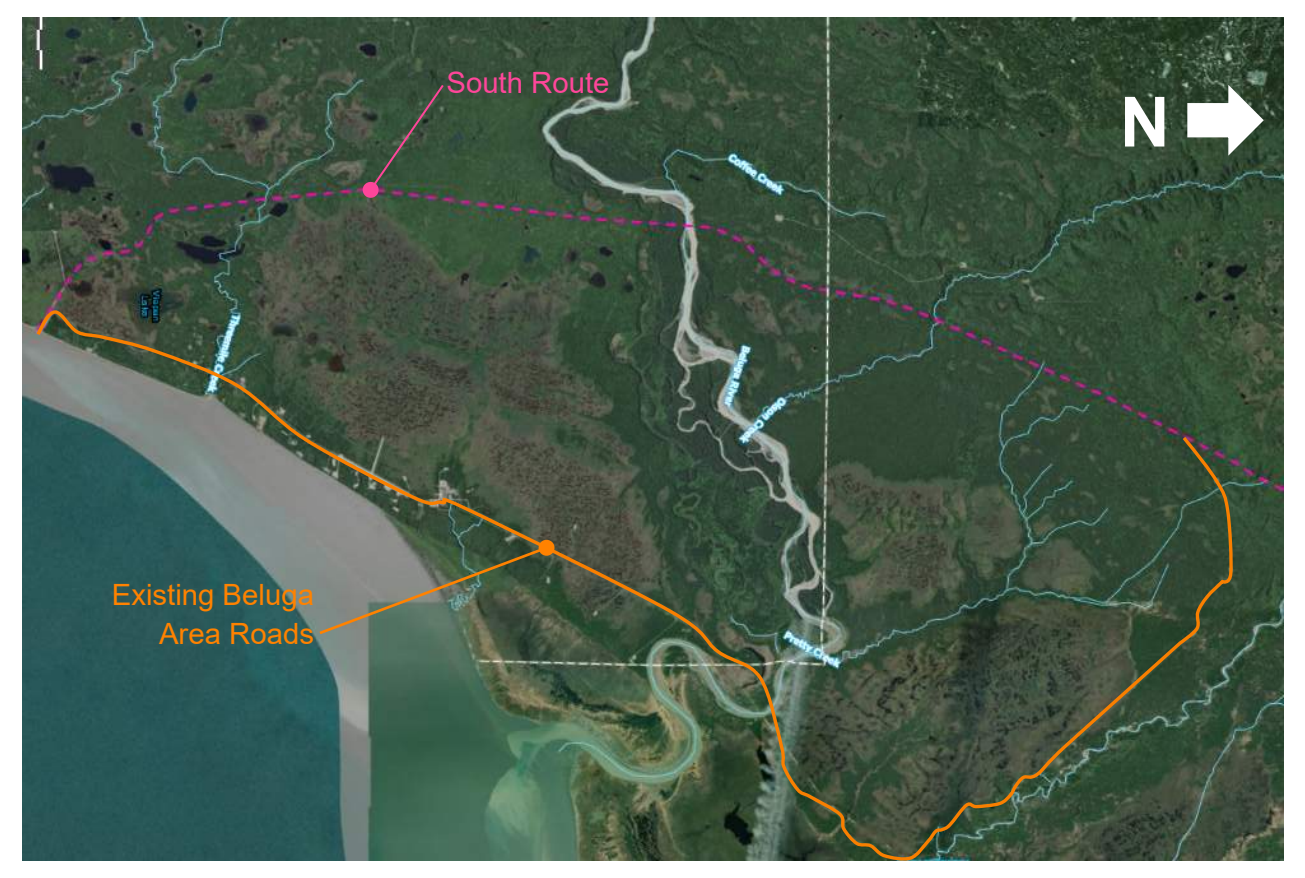
Figure 15: Beluga area roads for potential South Route connection

• If the South Route were to be constructed as a road, then it could connect to existing Beluga area roads in the vicinity of Pretty Creek, thereby avoiding the construction of the southernmost 16 miles of new road, a major bridge over the Beluga River, and numerous culverts (both fish passage and drainage). See Figure 15. The existing road length is about 20 miles from the Pretty Creek crossing to Ladd Landing and some of this existing road would need to be improved and widened to handle the additional traffic.