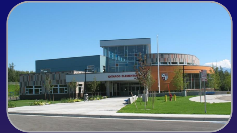
Iditarod ES ($25M) 50,605 SF K-5