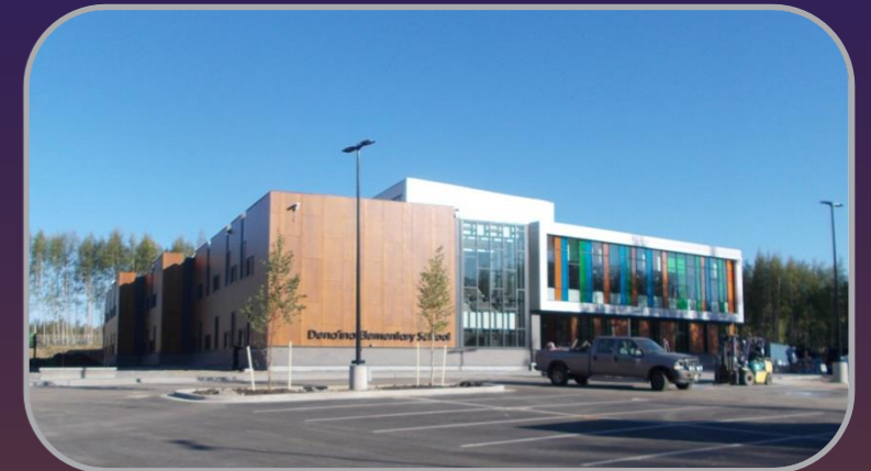
Dena'ina ES ($26M), 44,224 SF, K-5