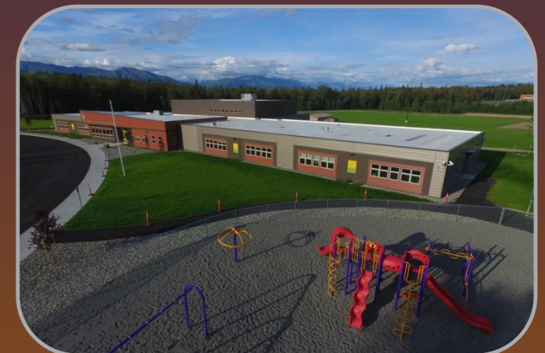
Fronteras ($7.5M), 31,000 SF Spanish Immersion