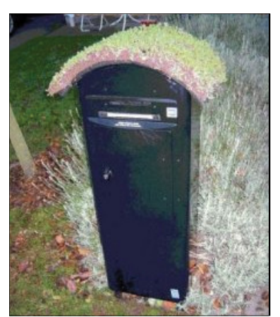
Green roofs aren't just for the roof to your house! Think about slowing runoff from other roofs, such as sheds, treehouses, even mailboxes!