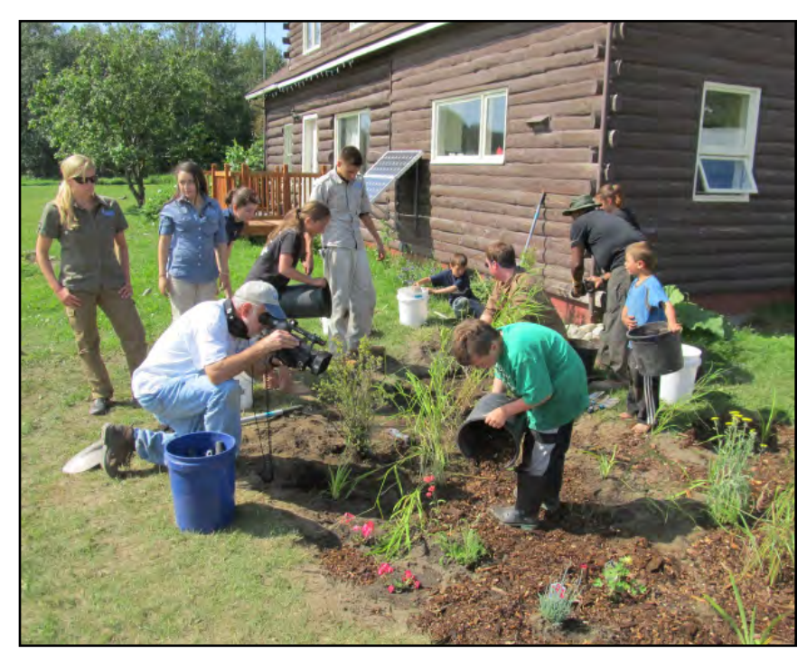
Filming rain garden planting with AquaKids.

Kids from Trailside Discovery Camp and cast of the national tv show AquaKids installed a rain garden at Spring Creek Farm, an Environmental Learning Center in Palmer. The rain garden will be featured on an episode of AquaKids.