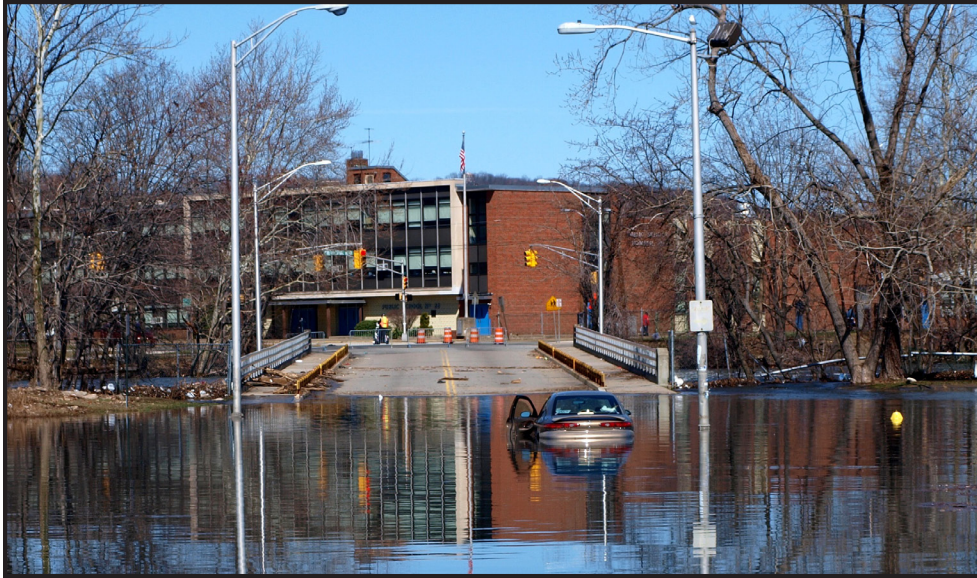
Submerged car in Little Falls

It wasn't supposed to happen again so soon. Three years after the Passaic River and its tributaries last rose above the flood stage, it happened again. In March a period of heavy rainfall washed out bridges, downed trees, and caused massive flooding throughout northern New Jersey. But this time, CERT was there to help.