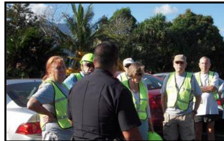
Receiving instructions from the police