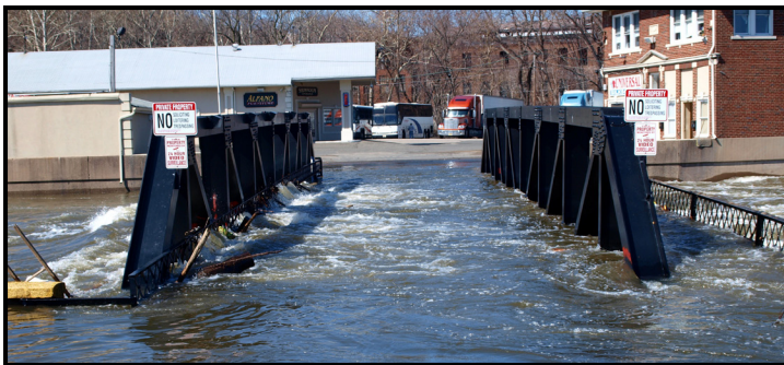
Alfano Island Bridge over the Passaic River

The shelter met all Red Cross guidelines and was inspected by the Red Cross, but was staffed solely by CERT members. "They give us the cots but we open the shelter and maintain the shelter," said Batelli. In order to staff the shelter, members took shelter management training offered by the Red Cross.