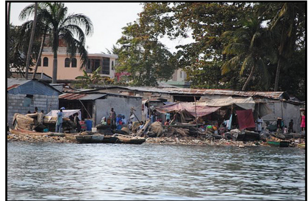
Damage in Port-au-Prince