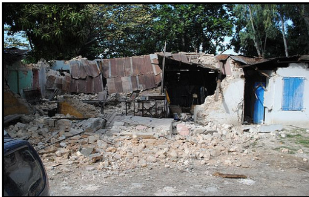
Damage in Port-au-Prince

Anthofer returned to Léogâne in June 2010, almost 6 months after the earthquake. “I was shocked,” she said. “Everything is really gone. Conditions are much worse now than they were in 2004. The devastation is worse [in Léogâne] than in Port-au-Prince. Imagine a three-story cinderblock building, and it is destroyed and the rubble is still there.” There are no