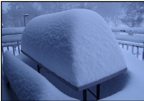
Snow pile from December 2009, the first of two major snowstorms in Charlottesville

Charlottesville, Virginia — where the storm dropped more than a foot of snow — saw all of these issues and more. But not all residents were snowed in. For the Charlottesville-UVA Albemarle County CERT, the storm meant action.